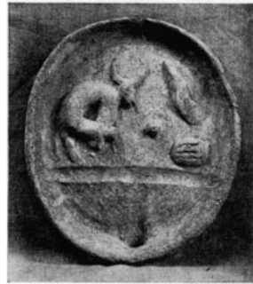
Tray of Offerings Dynasties IX-XII: circa 2000 B. C.

THE SERVICES OF THE DOCENTS have been rendered to 1,227 persons during the first quarter of 1908, nearly three times as many as during the last quarter of 1907. Many more persons have asked to see and talk over particular objects and special branches of the collections — in general, a much more rewarding use of time than the attempt to see many things.