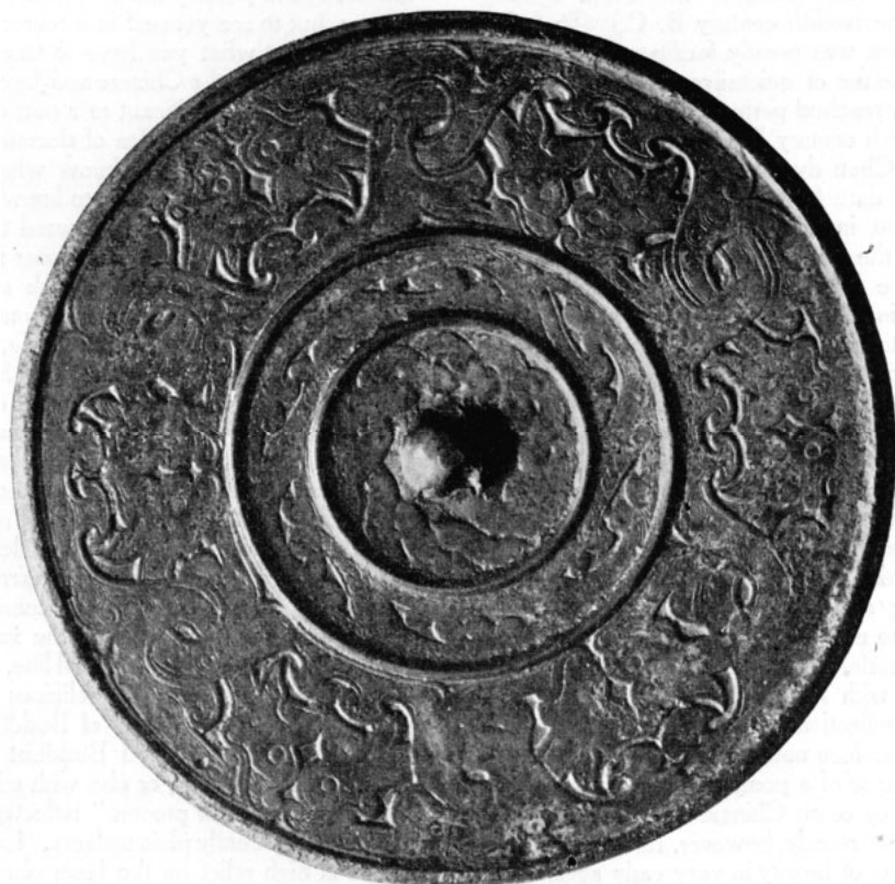
Figure 1. Bronze: Tsin period (220 B. C.) or earlier