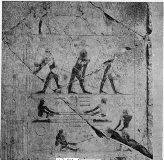
Servants gathering Water Plants

consists of a masonry structure, rectangular in outline, with slanting walls faced with stone or brick, the main axis of the building running generally north and south. Three features are essential to a Mastaba—an offering-chamber accessible from without, a niche adjoining for the statue of the dead, and a vault beneath for the reception of the sarcophagus. The offering-chamber was