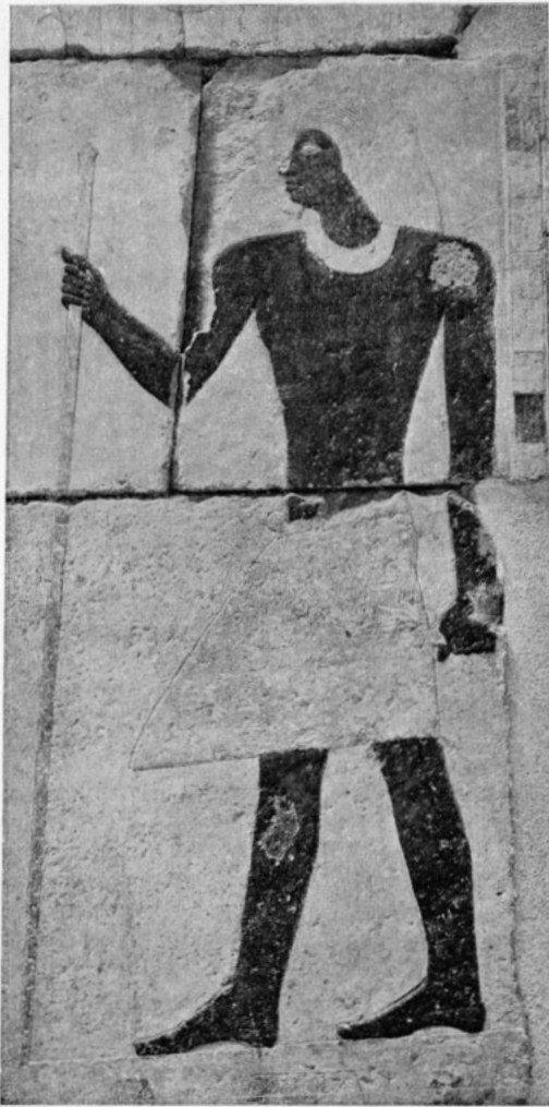
Figure of Owner of Mastaba D 23

usually placed in the southeast corner of the structure. Here the friends and relatives of the deceased brought provisions for his ka , or ghostly double, and prayed for its welfare. The chief feature of the chamber was the stele built into the west wall, which in the time of the Old Empire retained the general lines of a doorway, although consisting of a single piece of stone. In some Mastaba Chambers the walls are plain, the stele only being decorated. In other cases carved and painted reliefs decorate the walls, and to this class belong the two chambers installed in the Museum gallery.