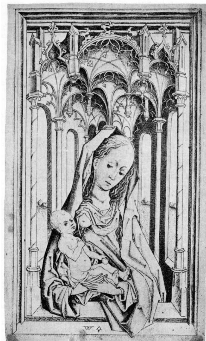
Madonna and Child