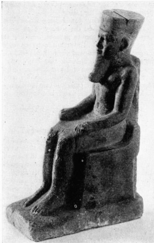
Limestone Statuette of Amen-Ré