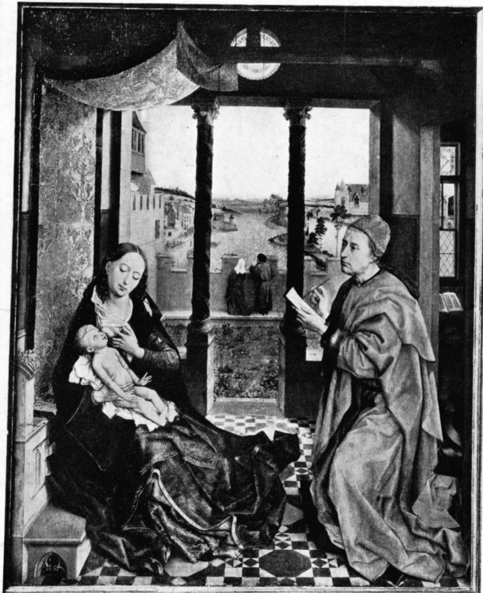
S. Luke drawing the Virgin