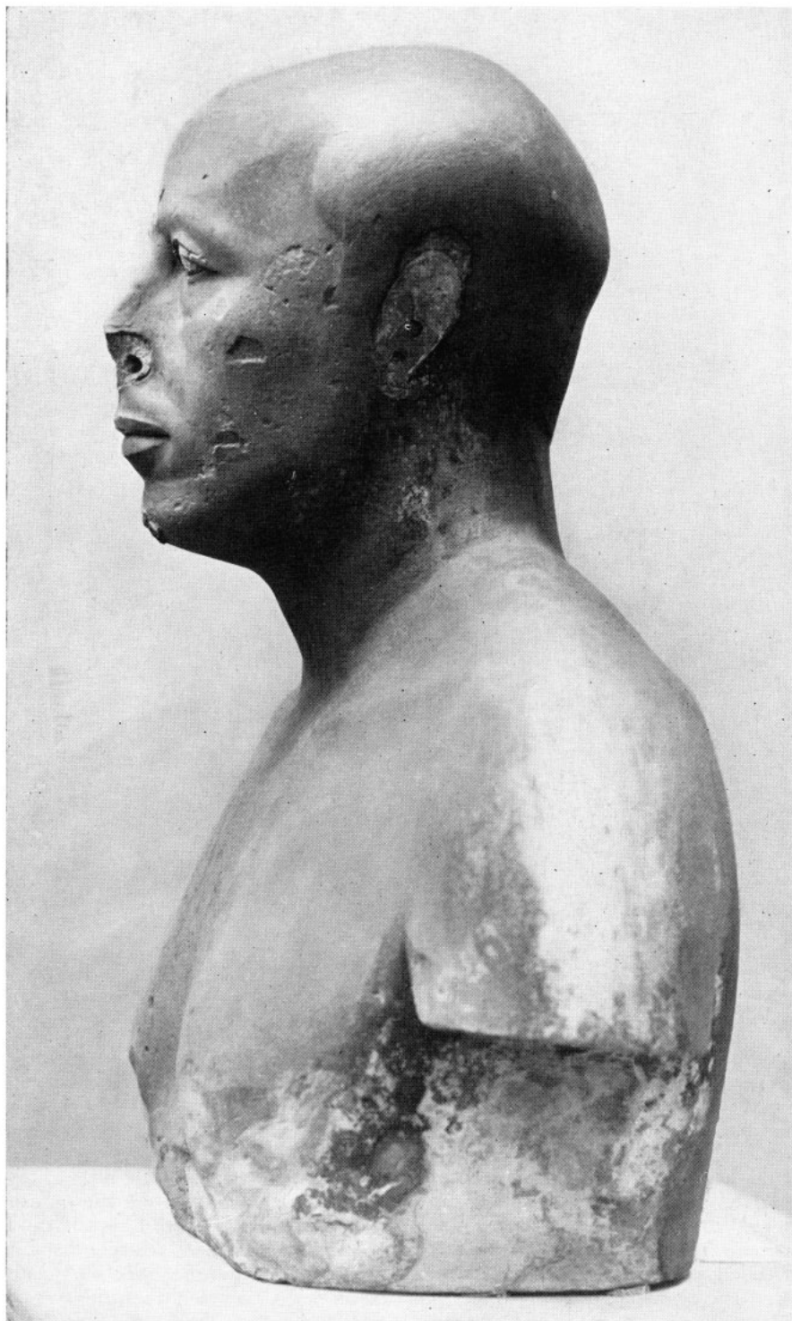
Prince Ankh-haf, left profile