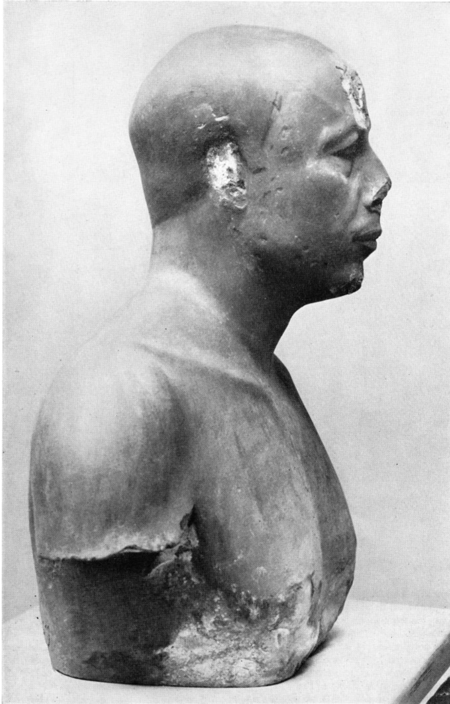
Prince Ankh-haf, right profile