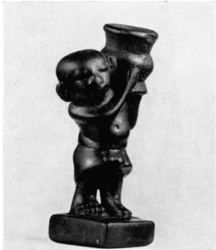
Fig. 2. Vase Bearer Helen and Alice Colburn Fund Actual Size

short skirt exposes, rather than covers, his paunch. Representations of dwarfs appear in Egypt since early dynastic times as illustrated by the incised drawing on a stone vessel fragment (Fig. 3) from Abydos in the Museum of Fine Arts, 1 and many sculptures, reliefs, and paintings from later periods picture these diminutive human beings. They are mostly shown as jesters, tending the pet monkeys and dogs of their masters, as workers skilled in the making of fine jewelry, and as house servants. Their grotesque appearance seems to have appealed to the Egyptian sense of humor, and some of the representations can definitely be rated as comical.