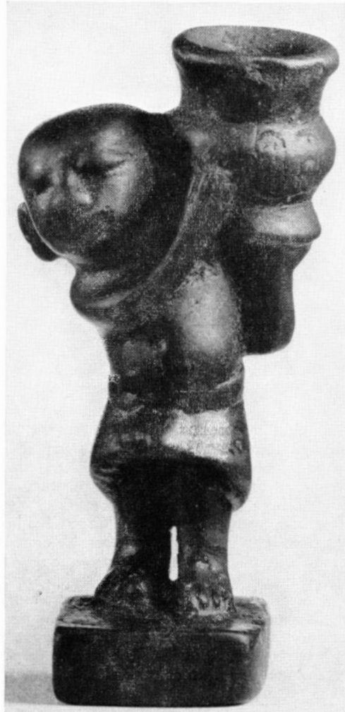
Fig. 1. Vase Bearer, boxwood Dynasty XVIII About twice natural size Helen and Alice Colburn Fund

now the face is no longer very clear due to the fact that, in modern times, the statuette was coated with paraffin as a preservative. The servant is represented walking, with his left foot advanced, and he carries on his left shoulder a jar, almost half his own size, which he supports with the palm of the left hand and steadies with his right. To keep the vessel approximately vertical and to offset its weight he leans over to the side, thus presenting a graceful movement and preserving a certain symmetry of appearance.