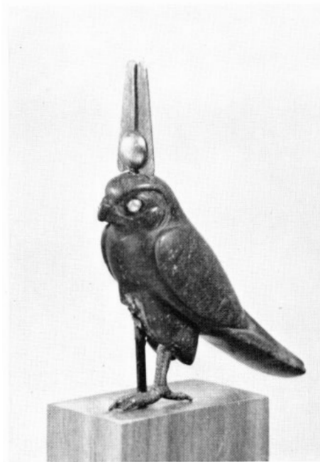
Fig. 4. Lapis lazuli hawk Otis Norcross Fund

ivory figurine is perhaps the most difficult to date while the little wooden antelopes are the easiest. Complete wooden combs are known which show this happy use of animal forms that often decorated toilet articles in the New Kingdom. In our case the teeth of both combs have been broken away, leaving only the upper part of the frame of the comb under the animal on the right of Fig. 1. The excellence of the carving suggests that these may have been made in the 18th Dynasty around 1400 B.C. when this sort of decorative work was at its height.