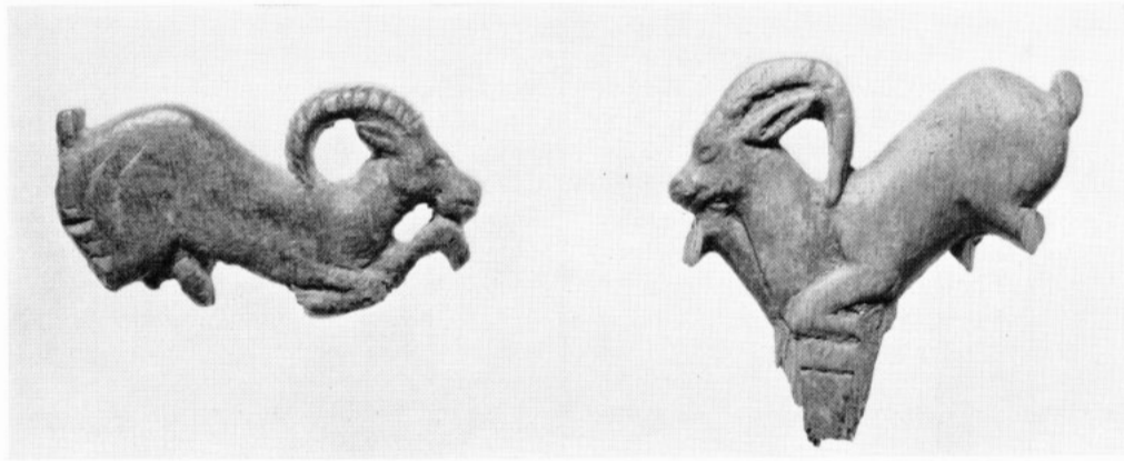
Fig. 1. Two New Kingdom Wooden Comb Ornaments Gift of Miss Mary S. Ames