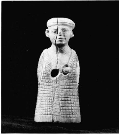
Fig. 6. Middle Kingdom ivory figurine