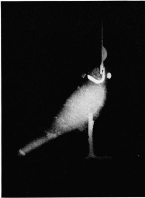
Fig. 3. X-ray photograph of hawk, showing gold wire inserted in head and pin holding rosette on tail