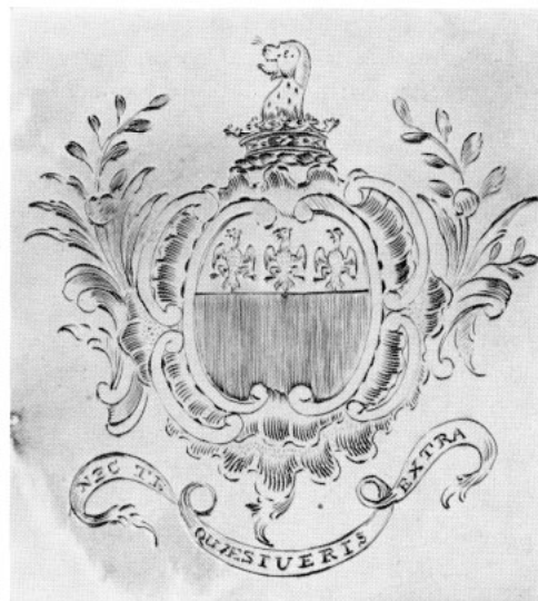
Fig. 1. Detail of Silver Basket

achieved in the next century's emulation of the design. The sides are so intricately pierced as to have necessitated considerable