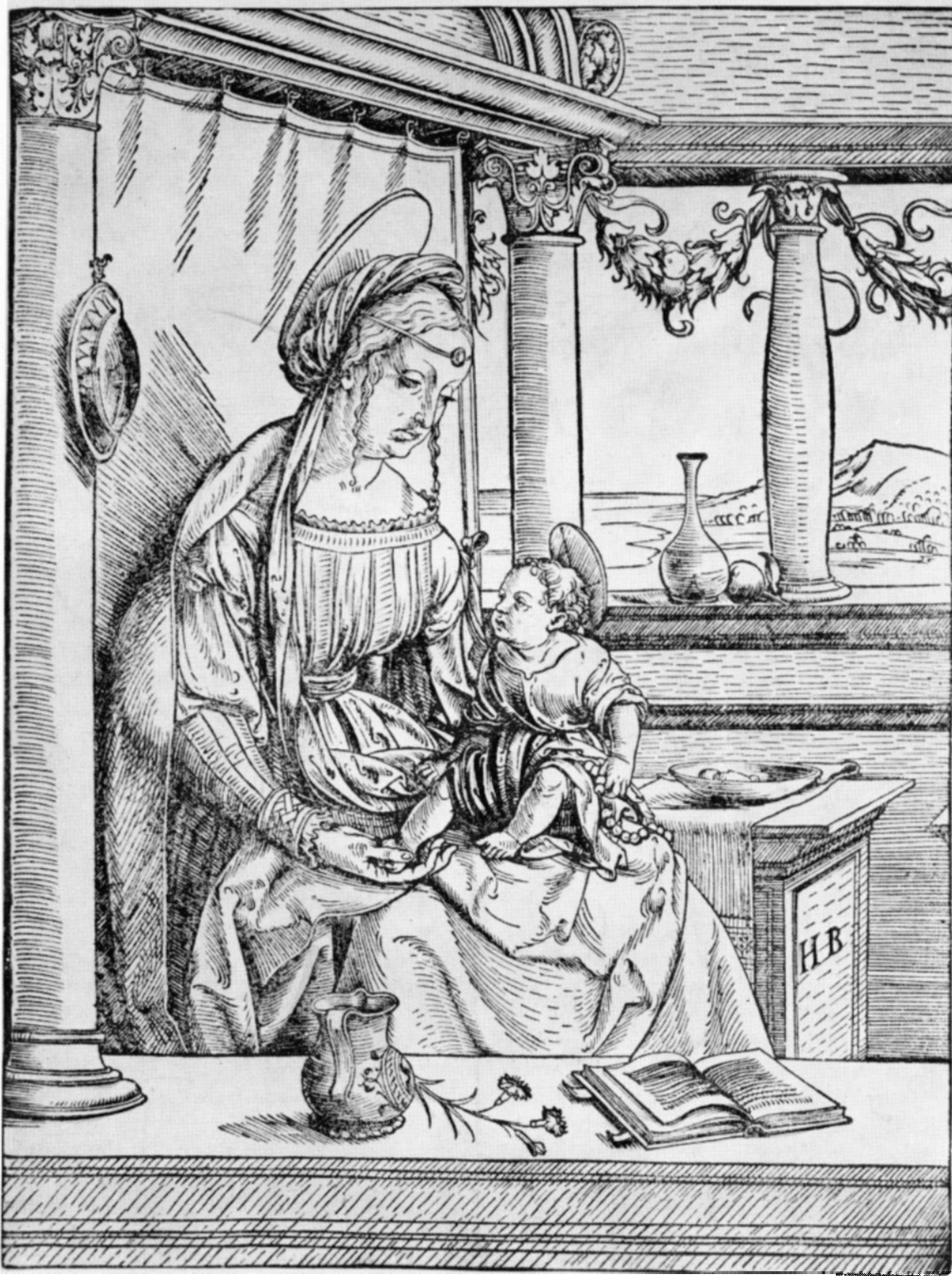
54.1044. Hans Burgkmair, The Virgin and Child (Woodcut) Otis Norcross Fund See Page 96