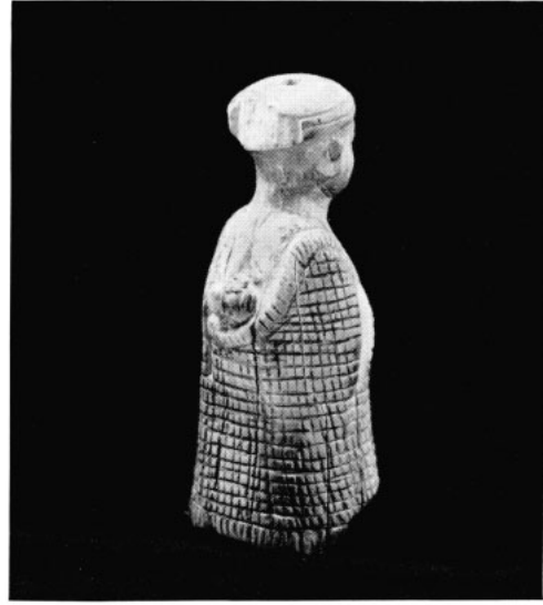
Fig. 7. Child held in fold of robe on ivory figurine