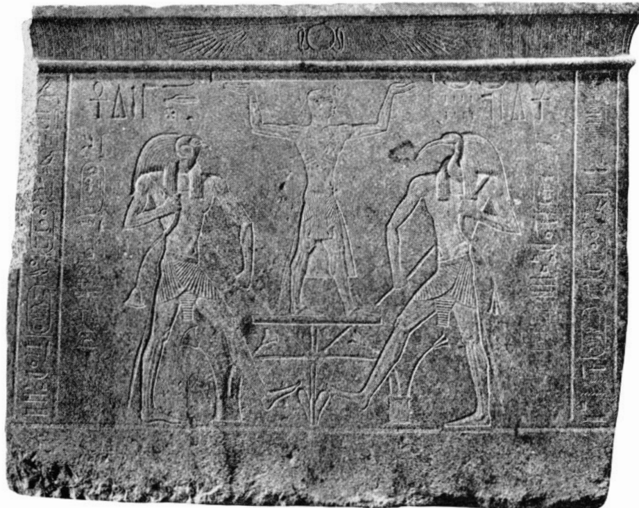
4. "Altar" of Atlanersa, King of Kush, 653-643 B.C. Harvard-Boston Expedition . 23.728