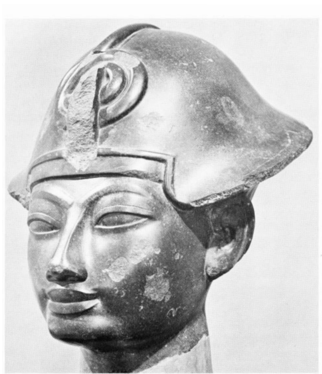
7. Colossal head of Amunhotpe III. The Brooklyn Museum.