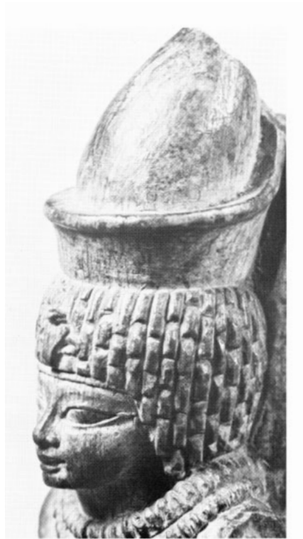
6. The Boston Statuette of Amunhotpe III. Detail.