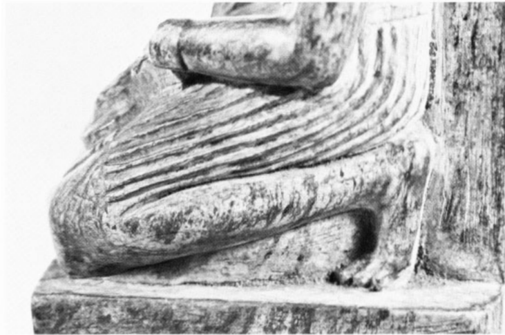
5. The Boston Statuette of Amunhotpe III. Detail.