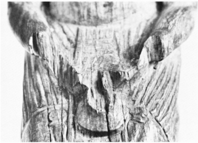
8. The Boston Statuette of Amunhotpe III. Detail.