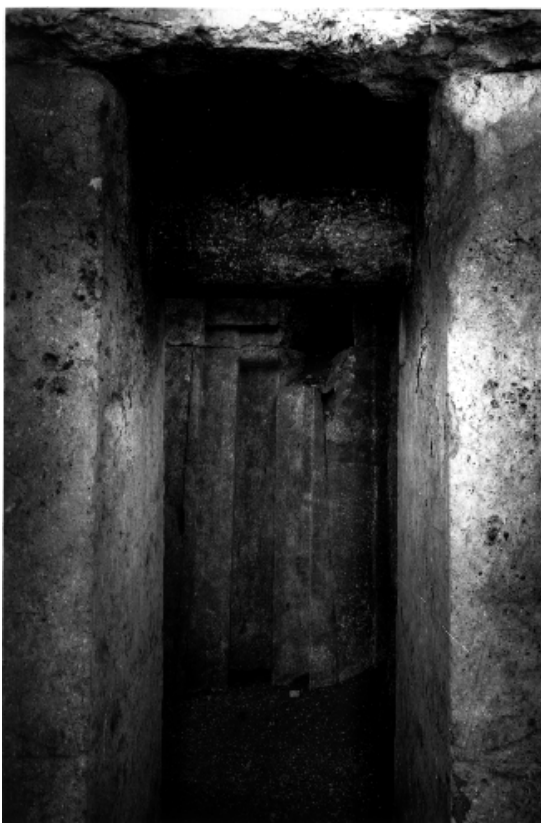
a. G 6030 (Ity), drum over entrance, text [3.1] (MFA B 8941)