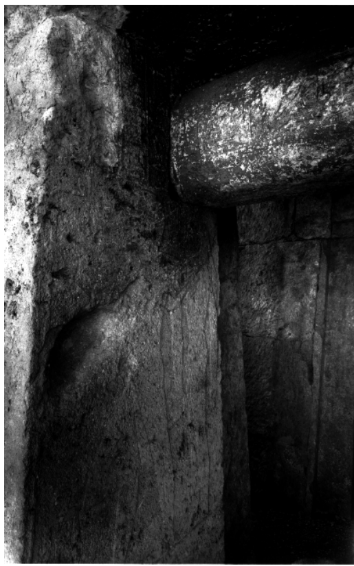
b. G 6030 (Ity), entrance, south jamb, texts [3.2- 3.3] (MFA A 7957)