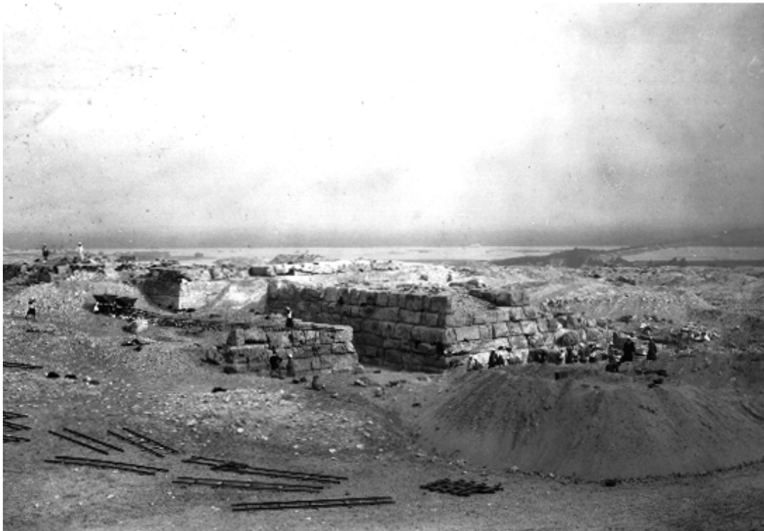
b. Clearing of Cemetery G 6000, winter, 1925. Workmen are exposing the south face of mastaba G 6010 and the adjacent mastabas G 6014, G 6015, and G 6016. View to northeast. (MFA A 3665)