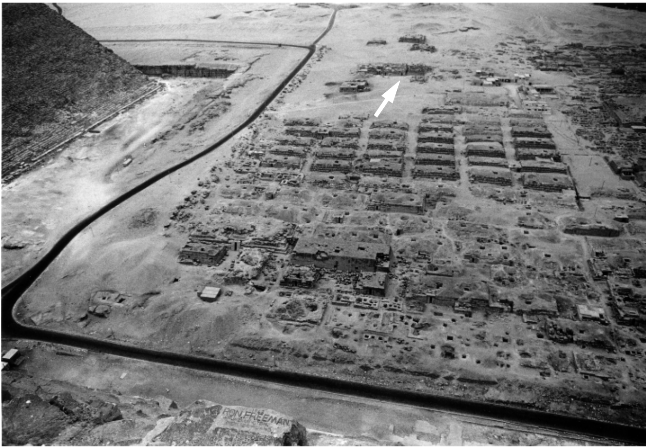
a. Great Western Cemetery, Giza. The G 6000 complex lies top center, across the road and to the north (right) of the corner of the Chephren Pyramid. View to west