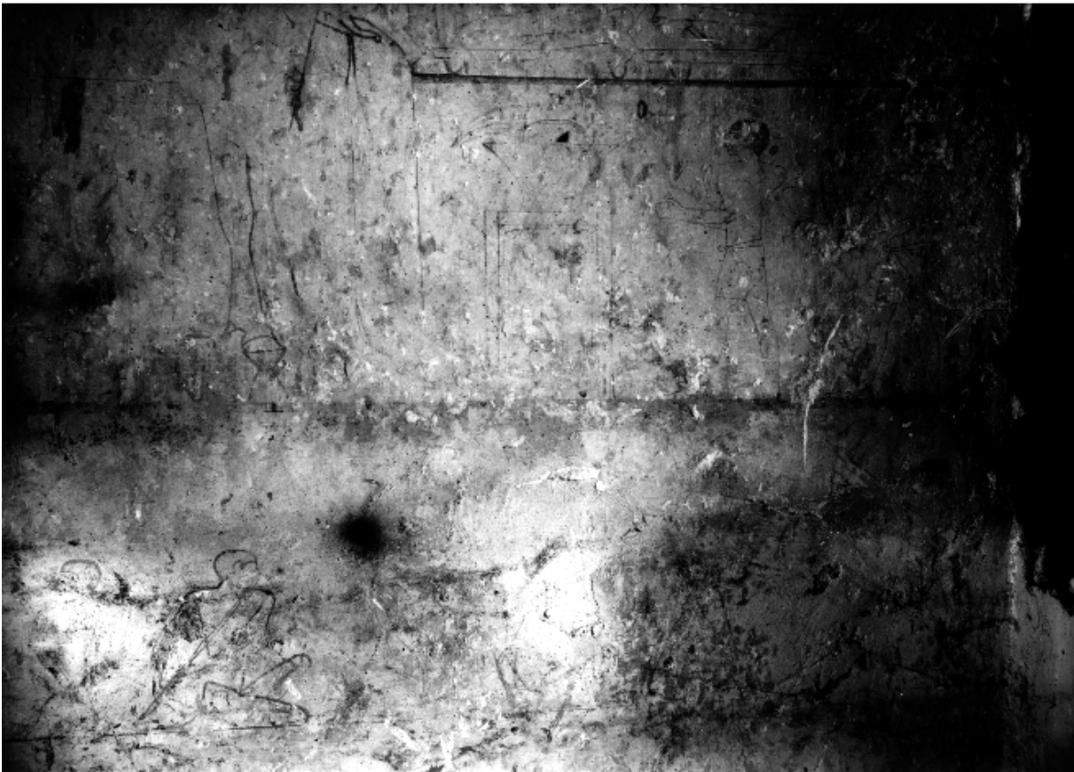
G 6040 (Shepseskafankh), chamber 2, south wall, text [4.6] (MFA A 7978 [top], and A 7986 [bottom])