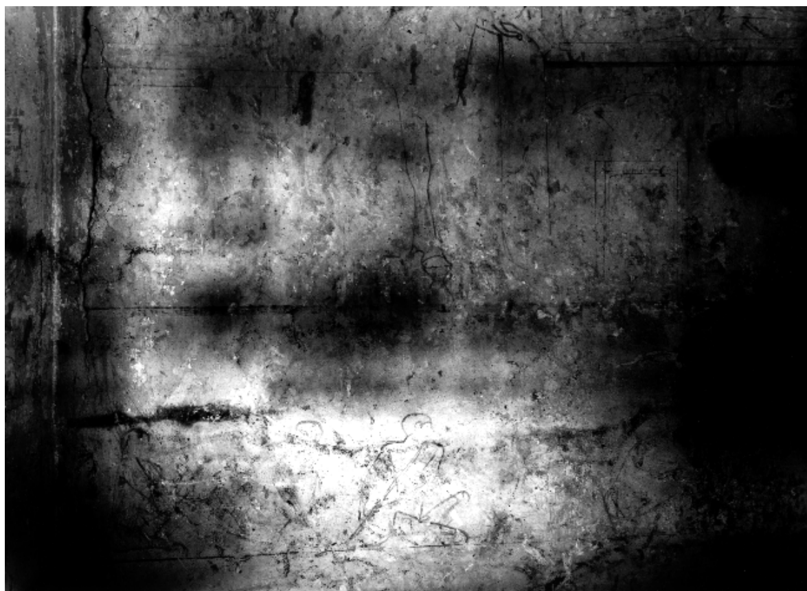
G 6040 (Shepseskafankh), chamber 2, south wall continued, text [4.73] (MFA A 7979 [top], and A 7988 [bottom])