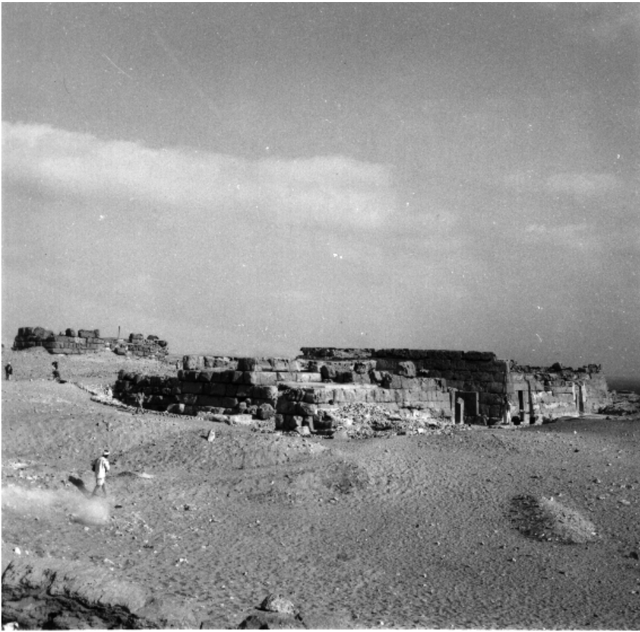
a. Cemetery G 6000, view to northwest, summer, 1972. G 6010 lies in the center, with remains of G 6012 and G 6014 exposed. To the north (right) lie G 6020 and G 6030