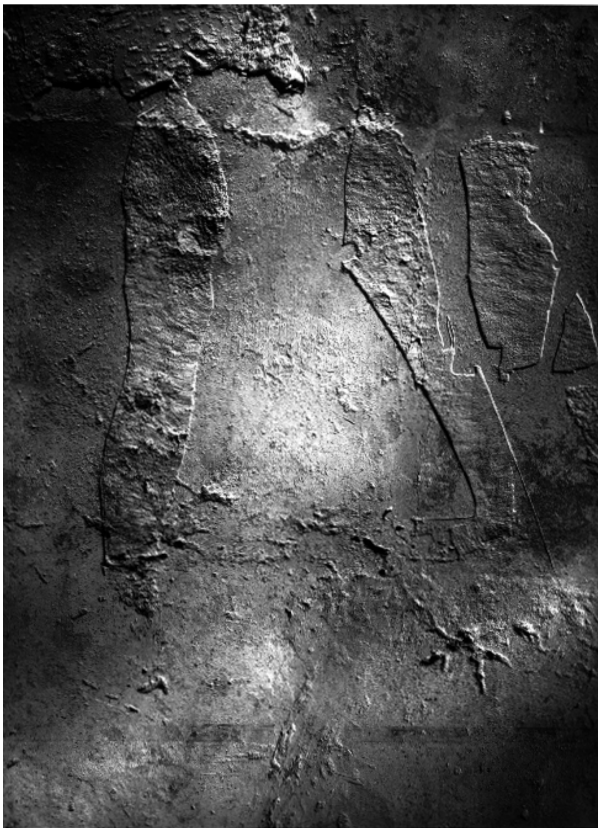
G 6040 (Shepseskafankh), chamber 2, east wall, main figure (MFA A 7987)