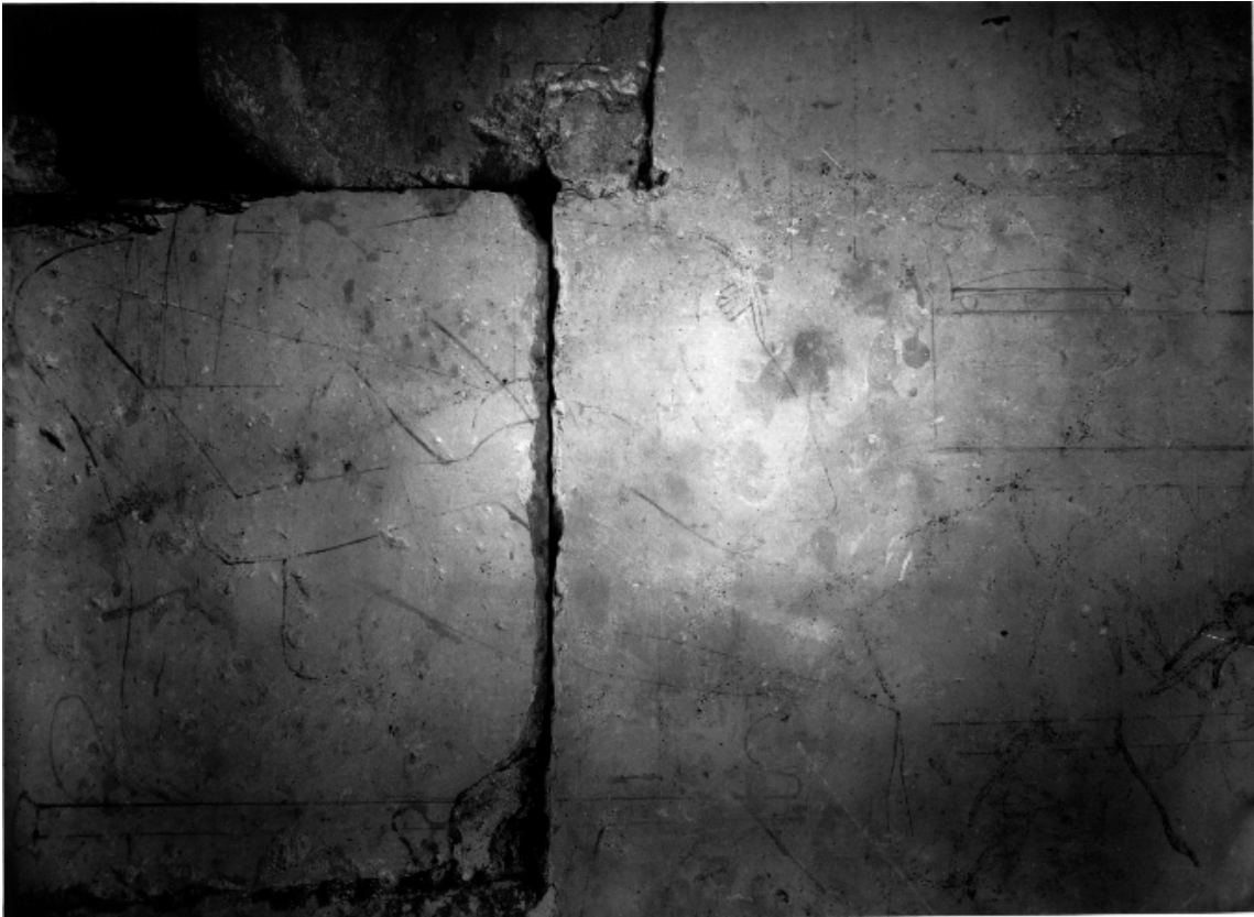
b. G 6040 (Shepseskafankh), chamber 2, west wall, text [4.83] (MFA A 8009)