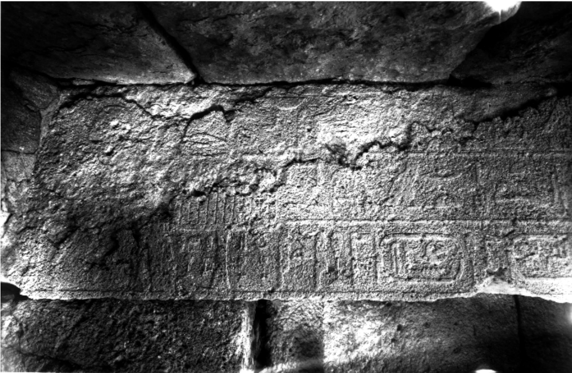
a. G 6030 (Ity), architrave, south end, text {3.9} (MFA A 7989)