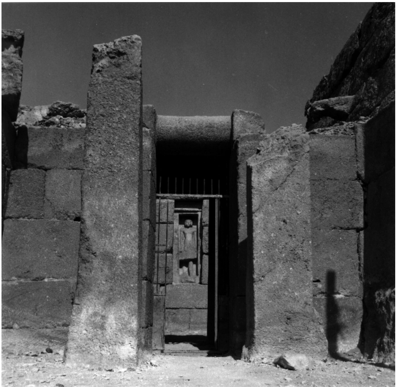
Entrance of G 6010 portico, with courtyard beyond, summer, 1972. View to west