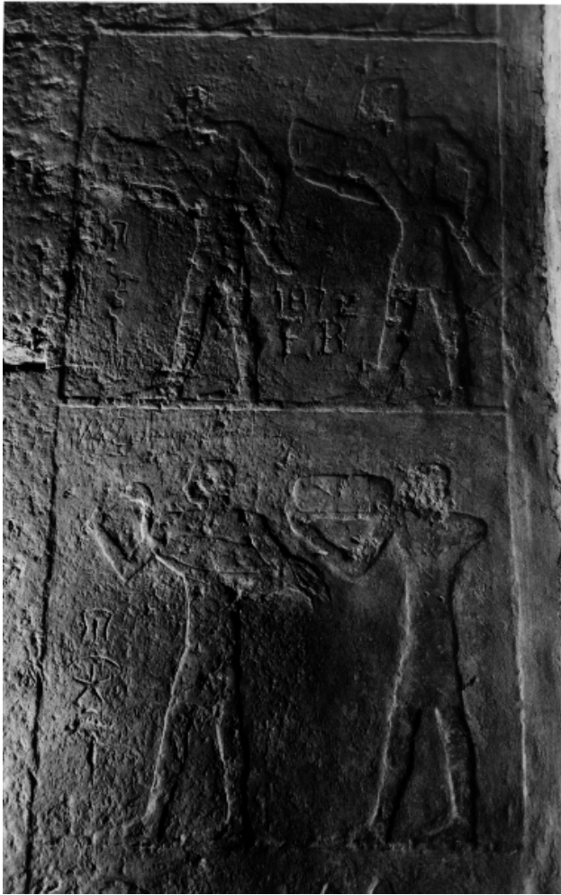
a. G 6020 (Iymery), chamber 3, west wall, northern section, texts (2.152–2.153)