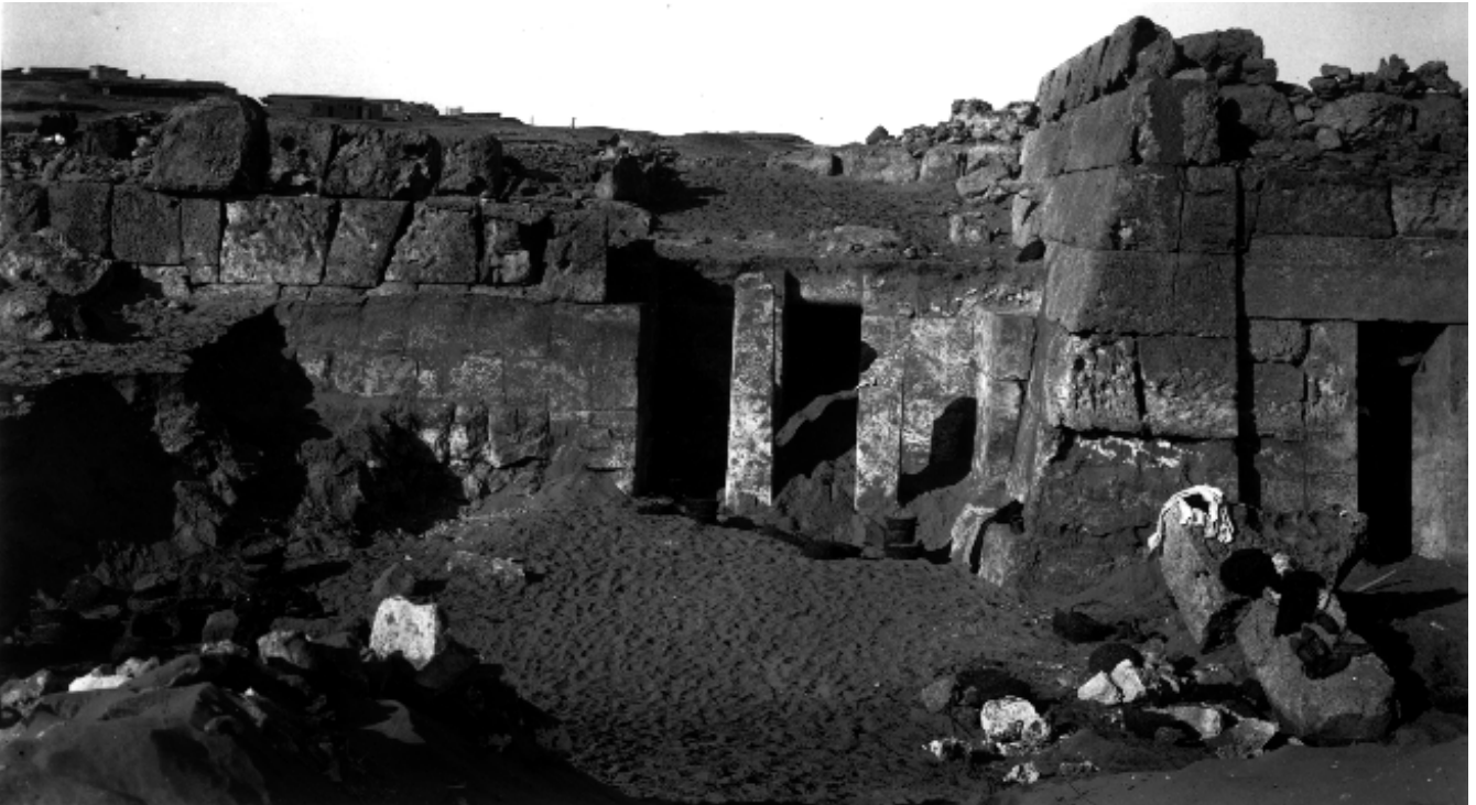
b. Entrance to G 6010 portico during clearing, November, 1925. The doorway to G 6020 lies at the right. View to west (MFA A 3660)