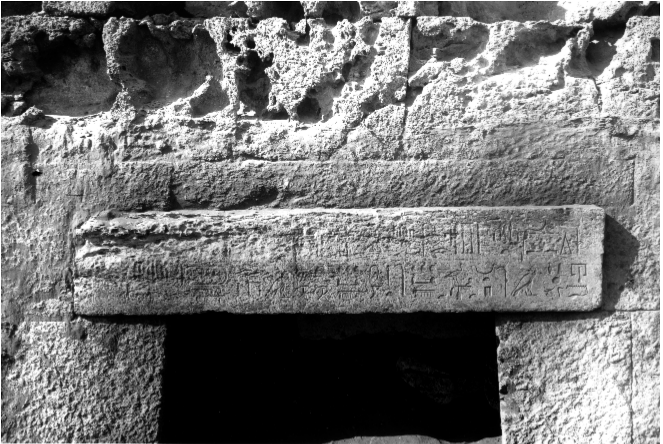
b. G 6040 (Shepseskafankh), lintel, text {4.1} (MFA A 3664)