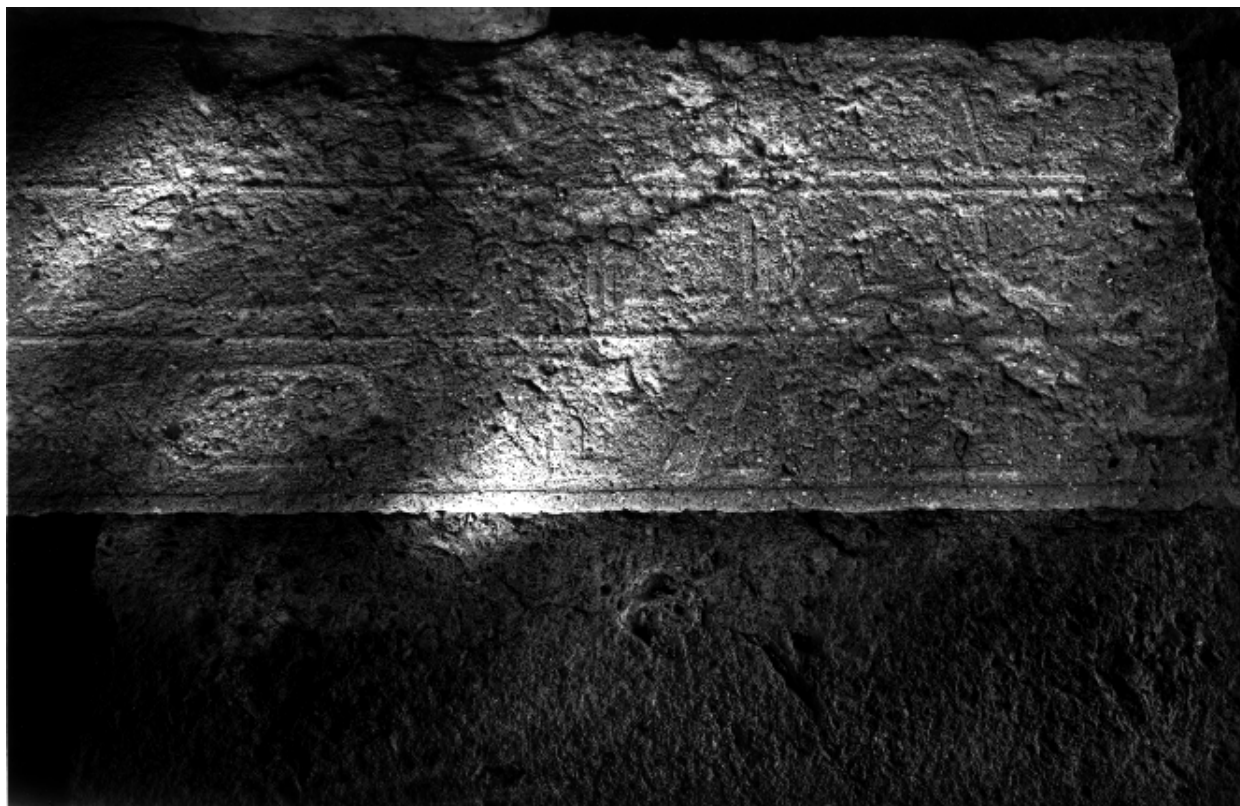
c. G 6030 (Ity), architrave, north end, texts [3.9] (MFA A 7993)